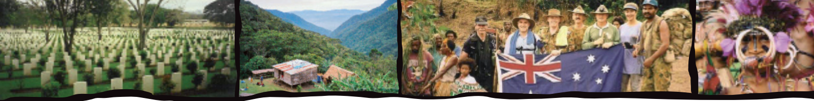
Table 1. Major Travel Health Issues & Considerations for Trekking the Kokoda Trail